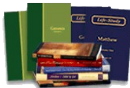
Amana Trust Online Bookshop